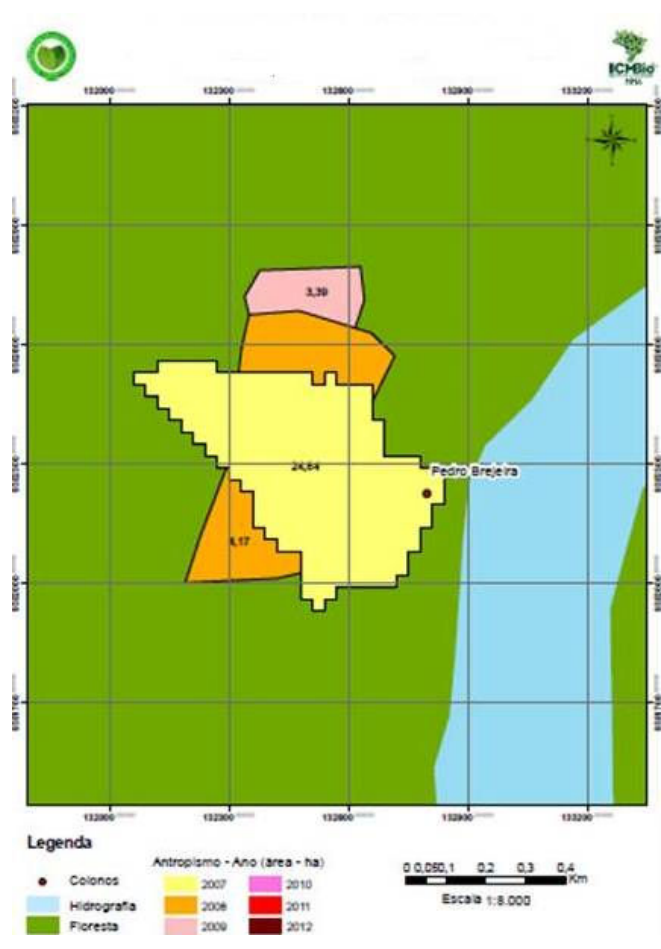
Figure 3. Example of muititemporal anthropism assessment (from 2007 to 2012) made by one of the authors for a resident of Sector 1 in EETM, produced with the collaboration of INPE. No deforestation could be detected after 2011.